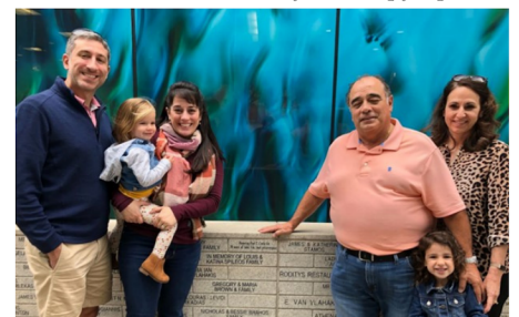
The Coules Family