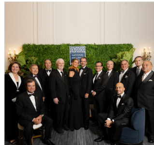
National Hellenic Museum Board of Trustees