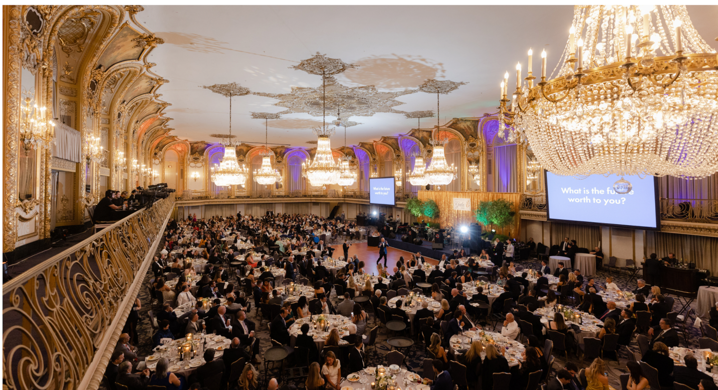
Reopening celebrated at festive NHM Gala [Page 4]