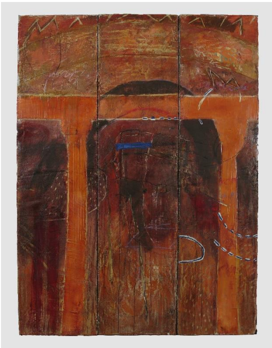
Labyrinth Wall , c. 1993, will be shown in NHM's newest exhibition "George Kokines: Layers Revealed" opening Sept. 20 th .