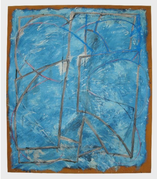
Aeribatis , 1990, will be shown in NHM's newest exhibition "George Kokines: Layers Revealed" opening Sept. 20 th .